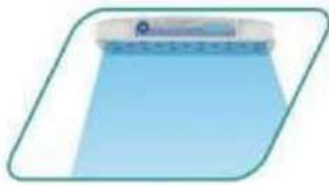
Upside phototherapy unit