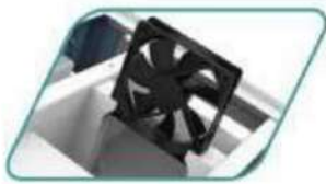
Removable axial DC-Fan