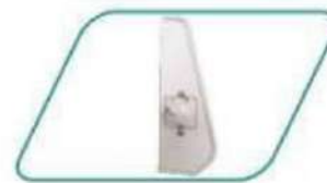
Two level adjustable of humidity