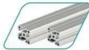
Aluminum alloy material